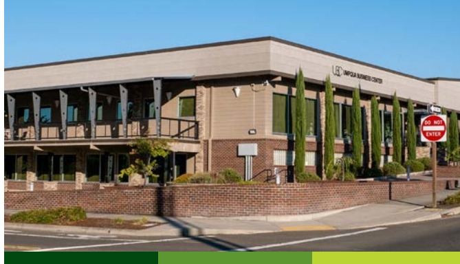
Umpqua Business Center, 522 SE Washington Ave., Roseburg